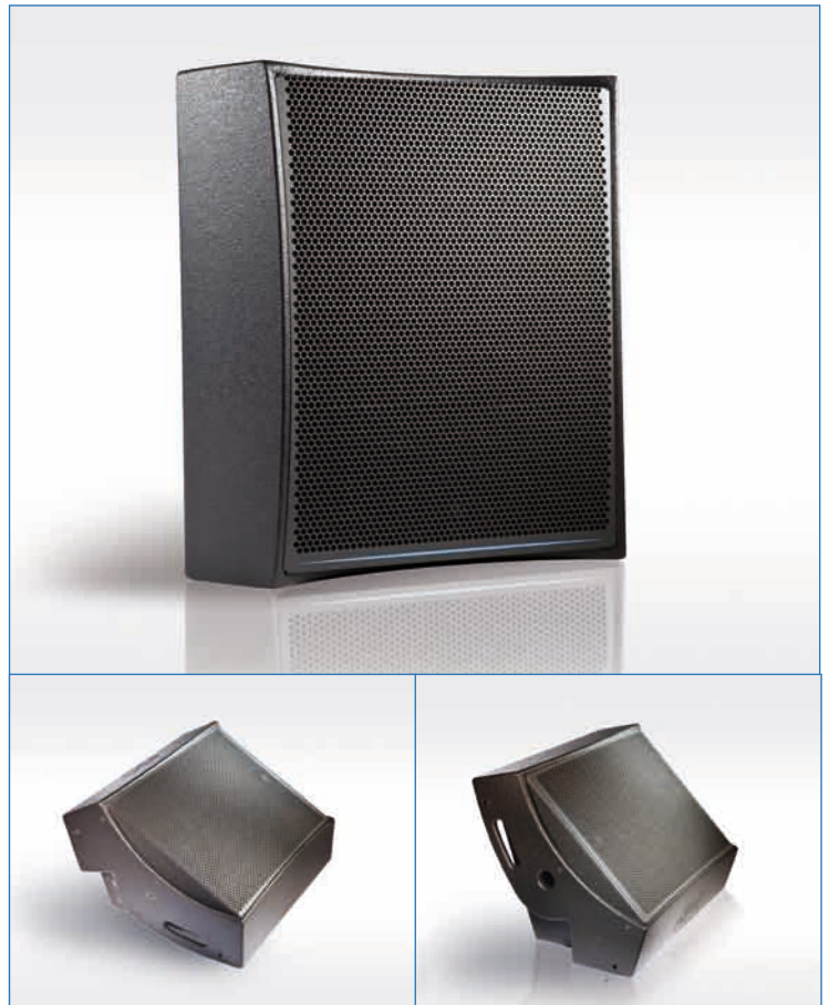
Multi purpose DX15 speaker in FOH and floor monitor

The 15APT90 option is an angle tuning plate with the ETDX15 bracket that is hidden in the sides of the cabinet. The QFS4 comprises 4 parts for a quick and secure hanging with bolts or pins. The DX15 works in mono amplification and requires the use of an APG processor in the musical high power applications. For low and very low frequency reinforcement, the following subs are recommended: TB115S, TB118S, TB215S or TB218S.